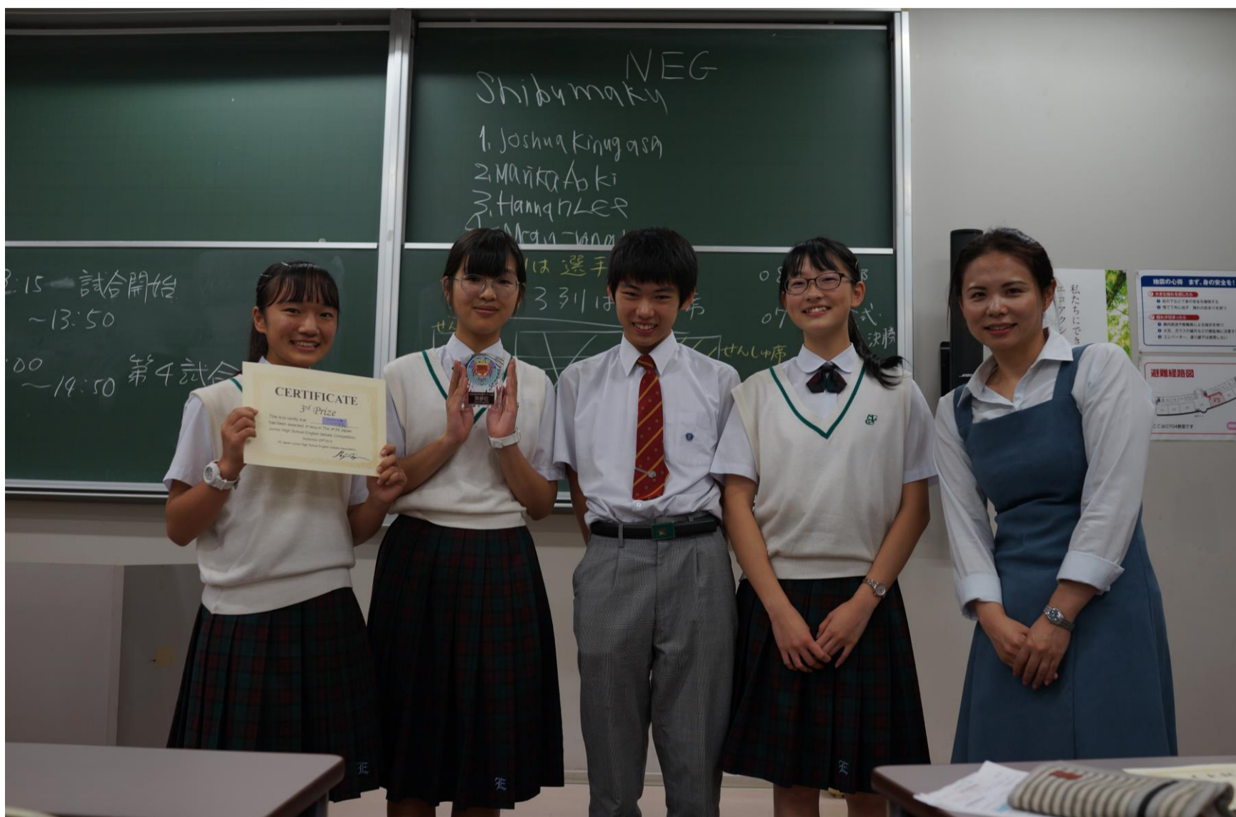
The award winning students and their teacher