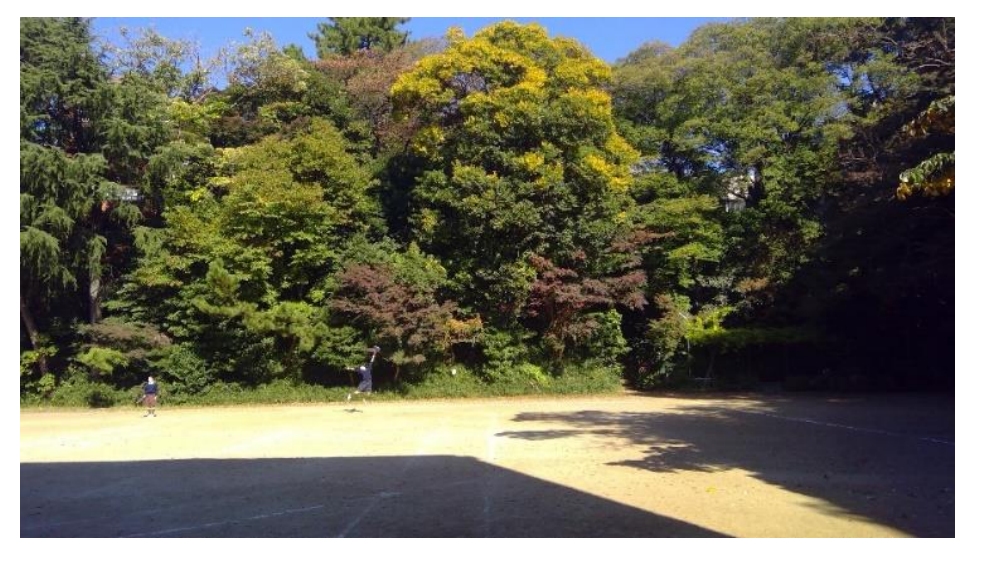
Shoei's forest

Out school and its protected forest sits amongst the sprawling