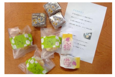
The delicious snacks we bought

Overall, had we fulfilling day. Later in the week, the teachers announced Shoei had received an appreciation award from Oofunato city, which was affected heavily by the earthquakes back in 2011.