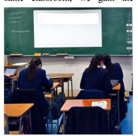
English class for returnees

returnees in one school grade is about 15 students, whereas Shoei takes in more than 45 returnees annually. As returnees and nonreturnees come together in the same classroom, we gain the