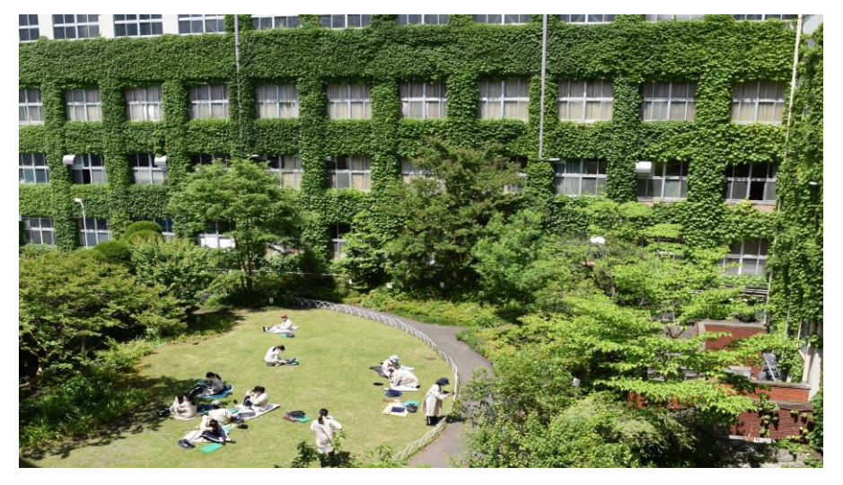
Shoei Joshi Gakuin in the summer

Every year in November, Sr.2 students in Shoei hold a "Recovery-assistance week" to raise awareness about earthquakes and donate money to those affected by the 2011 Tohoku earthquake. During this week, Sr.2 students sell snacks (slightly expensive than the original) from Tohoku to Shoei students. This year, they went around classrooms or used school broadcasting system to