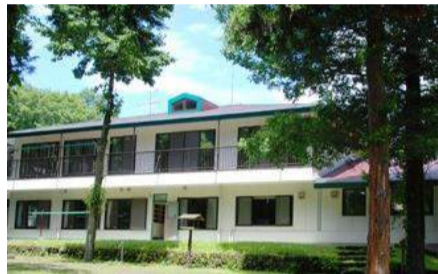
Hinode Gakuen's Karuizawa Sanso

Hinode Gakuen also has study-related events held outside of school. One of these is the "Hinode Gakuen Karuizawa Sanso." This is held at a mountain villa in Karuizawa, Nagano