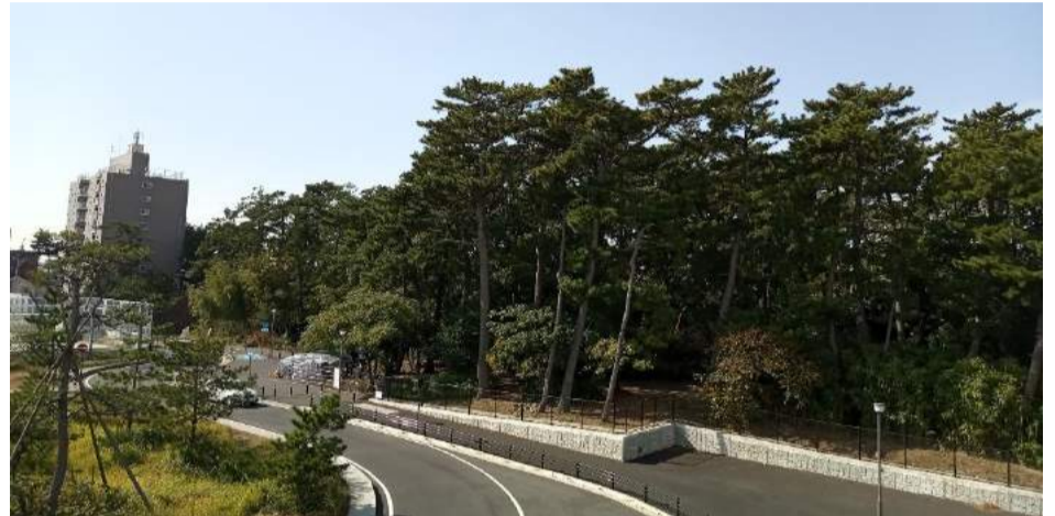
Japanese black pine trees in Sugano

planted for coastal sand control forest long ago because Sugano was facing the sea. Sugano is inland now but the pine trees have remained. When you visit Sugano, you can see pine trees, old houses and vestiges of cultural people.