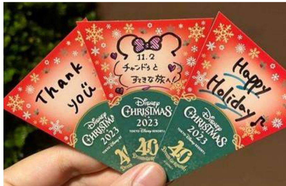
Dream Garland Card

These programs were planned for two and a half years before they started. The organizers of these programs wanted to make a year which all people including guests and the cast can enjoy together, so they proceeded with the plan by choosing "Tsunagari," or connection, as the keyword. A cast