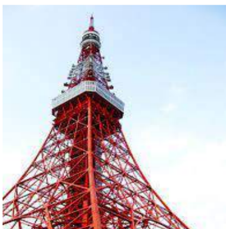
Tokyo Tower Feels the Sky

Tokyo Tower has watched over the changes of the city during the Showa and Heisei eras. Today, it is one of Tokyo's leading tourist destinations and is visited by approximately 3 million people a year from Japan and abroad. Many people recognize it as a symbol of Tokyo.