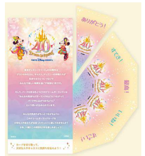
Dream Garland Seal

to come here everyday and talk with many people to make them happy with my Dream-Garland-Card!" An old woman recalled, "A little pretty girl handed me a Dream Garland Card. We talked about various things for a while, and we became friends. We had a truly happy moment together."