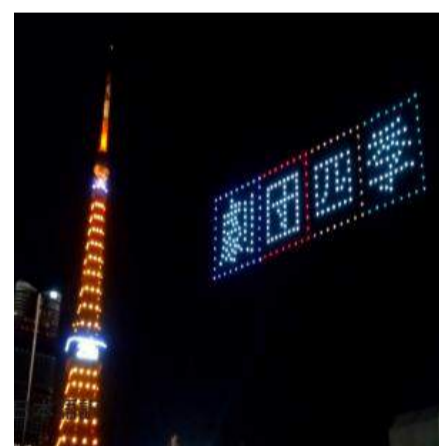
A drone show commemorating the 25th anniversary of Shiki Theater Company

which had its grand opening in 2022, is Japan's largest esports park set in Tokyo Tower. Each