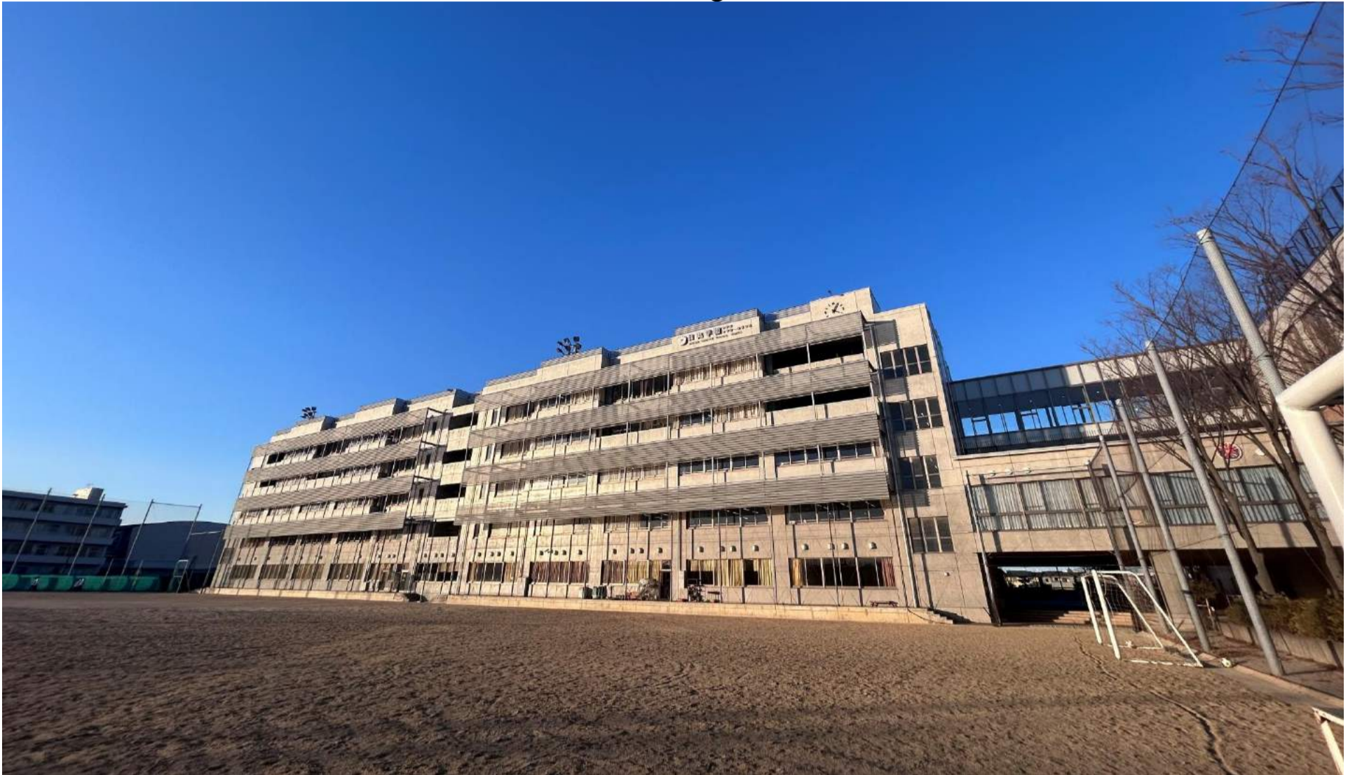
Hinode Gakuen Junior and Senior High School