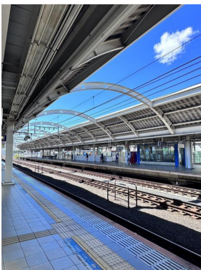
Kyodo station with beautiful scenes