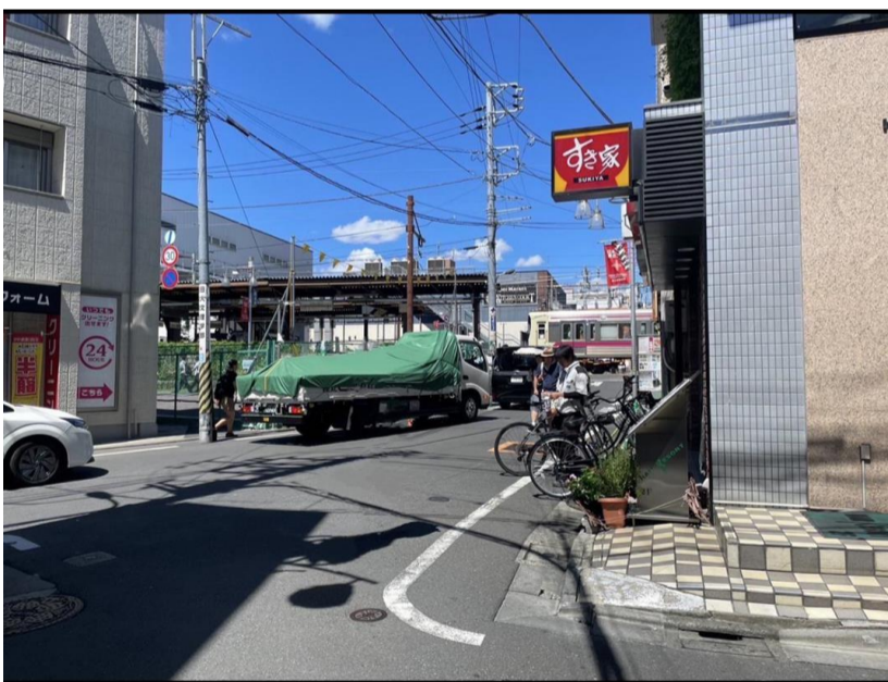
Sakura josui townscape

Sakura Josui is located in Setagaya Ward, Tokyo. There are quiet residential areas around Sakurajosui, which is relatively safe in Setagaya Ward, so you