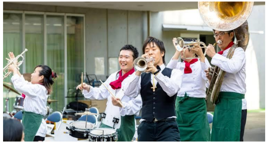
Shimotakaido Music Festival of the Photo by Setagaya Line homepage of Shimotakaido that could not be

For example, there are no safe sidewalks because there are many 6 meter roads. this problem was discussed at the "Urban Development Council." To solve this problem, it is first necessary to write about the land use of