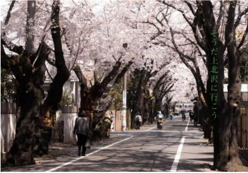
Poster of Kamikitazawa with beautiful

Do you know how nice Kamikitazawa is. First, Kamikitazawa is called the city of good and free housing. However, this great city isn't known by many. So, we will introduce Kamikitazawa to overcome the point. First, let me talk about the appeal of Kamikitazawa.