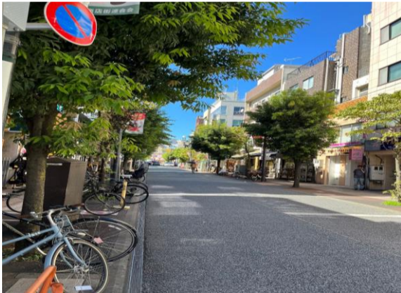
Chitose Karasuyama with its lively streets