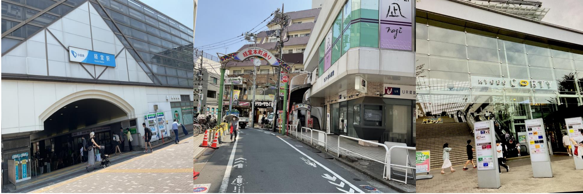
Kyodo station crowded with many people

K yodo is located in the center of Setagaya Ward, which is home to the largest number of people in Tokyo with 940,000 people. Kyodo Station is a 17-minute walk from Nihon University Sakuragaoka High School and is an express stop on the Odakyu Odawara Line, which will take you to Shinjuku Station in 14 minutes. Many buses also run, so you can go directly to Shibuya Station. Because of its convenient access to the city center, about 76,000 people get on and off the train each day.