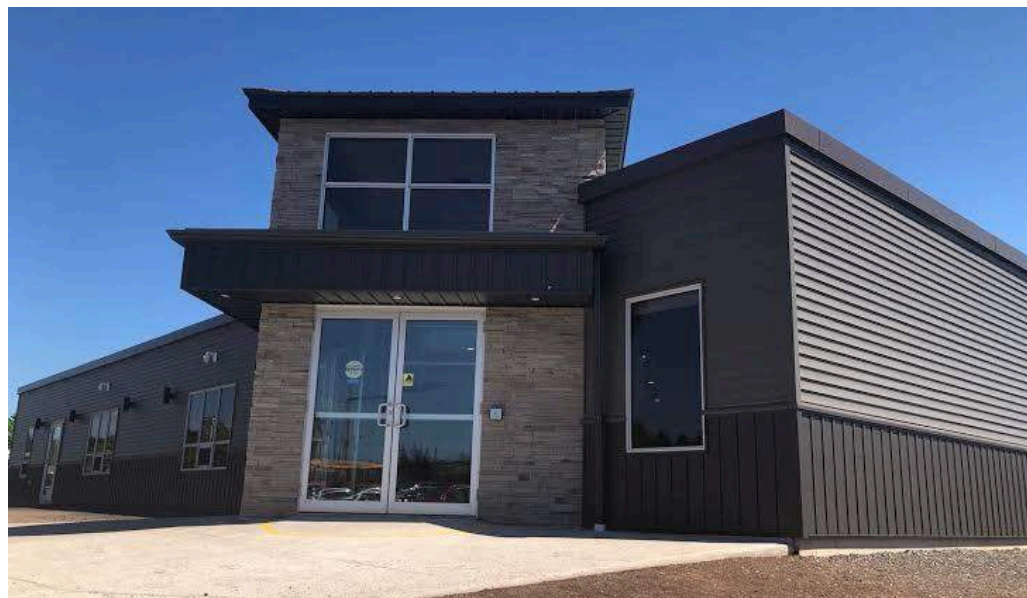
Grace Baptist Church