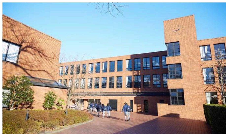
A building of St. Hilda's School