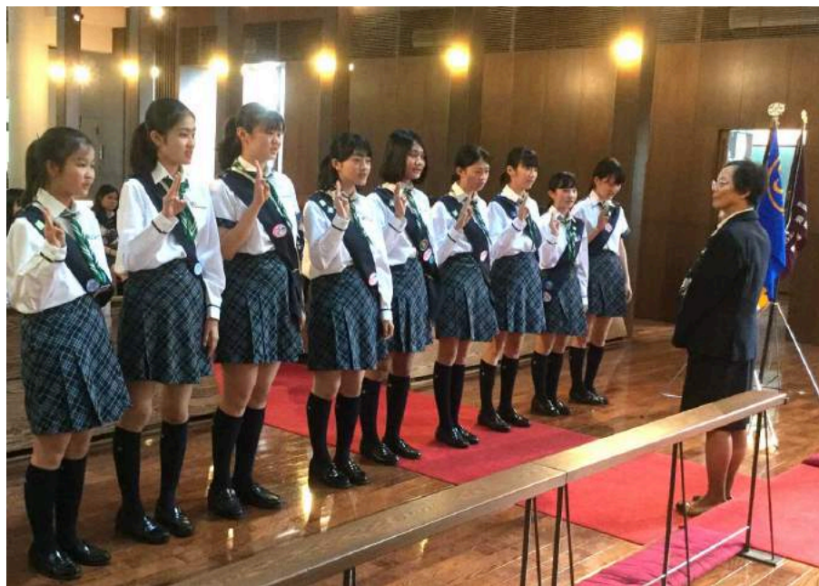
St. Hilda's School Girls Scouts