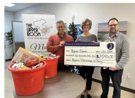
Donations to the Upper Room from their “Rejoice! Christmas in Song”