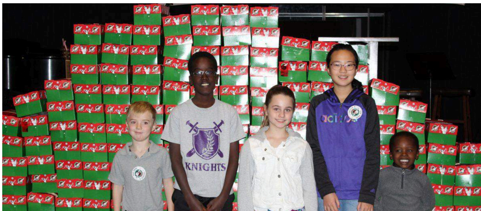
A mountain of shoeboxes