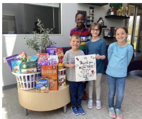
Donations of supplies to Queen Elizabeth Hospital staff that work in the Emergency Department

GCS is making a strong effort when it comes to the school members being involved with