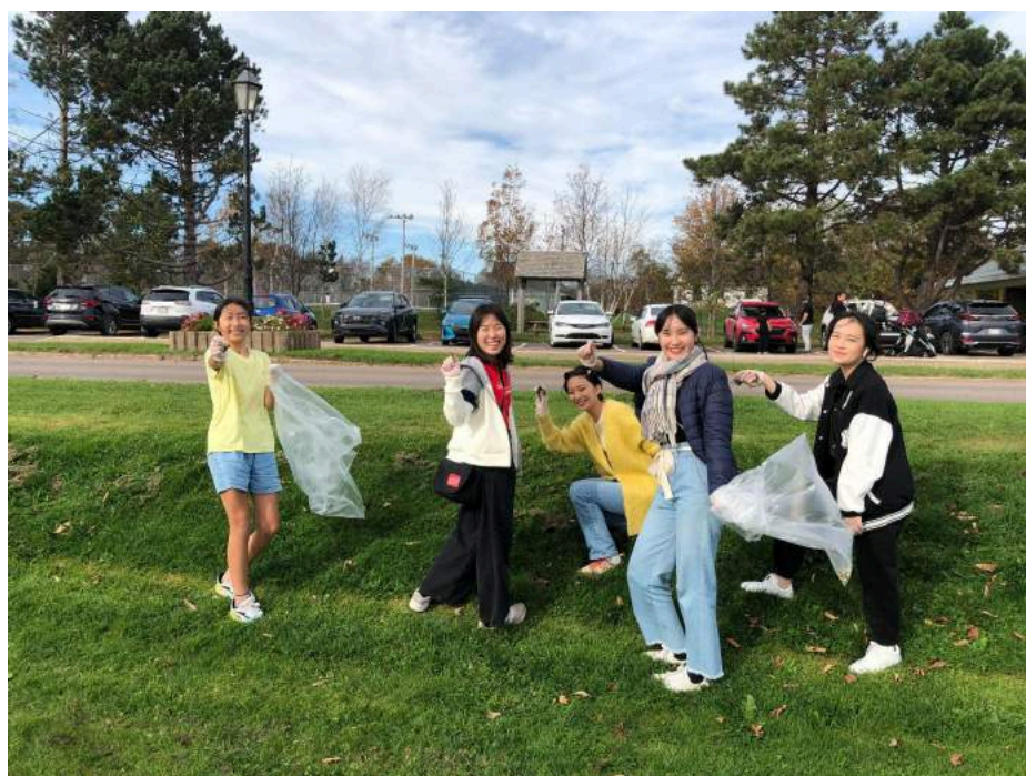
Clean-up around Victoria Park in Prince Edward Island, Canada

Grace Christian School, a school in Prince Edward Island, Canada encourages students to do volunteer work, and it is graded as one of the assignments in their Christian Ethics class. During the class, students learn about Jesus Christ by using the Bible. All Grades between 7-12 students need to volunteer for 35 hours each school year, but most students exceed the requirement. They can do any sort of volunteering job they want to do. Some sort of volunteer examples are cleaning the school and the