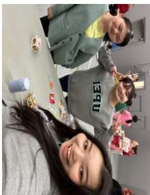
Students at Youth Group

Youth group is a group of students between the ages of 13-18. They gather at GBC every Friday night to learn about Christ through fun activities. Youth leaders plan what activities and games they will be doing every week. When some seasonal events like Halloween and Christmas take place, they offer special activities to celebrate the season. For instance, they can do pumpkin carving and make their own jack-o'-lanterns around Halloween. They can also build gingerbread cookie houses and decorate them with candies and cream in the Christmas season. However, the main purpose of the youth group is to learn about God. It never changes. They always take an hour to sing some songs and worship. It is very inspiring to see young people learning about God