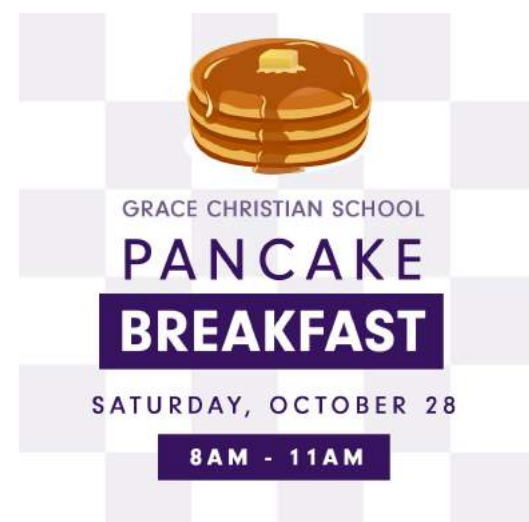
Poster of Pancake breakfast From Instagram of Grace Christian School