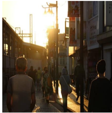
(caption) Shopping street of Chitose Karasuyama

The news section of the website also includes the "Machizukuri Committee News" to let people know about the activities of the "Machizukuri Committee," which is engaged in urban development.