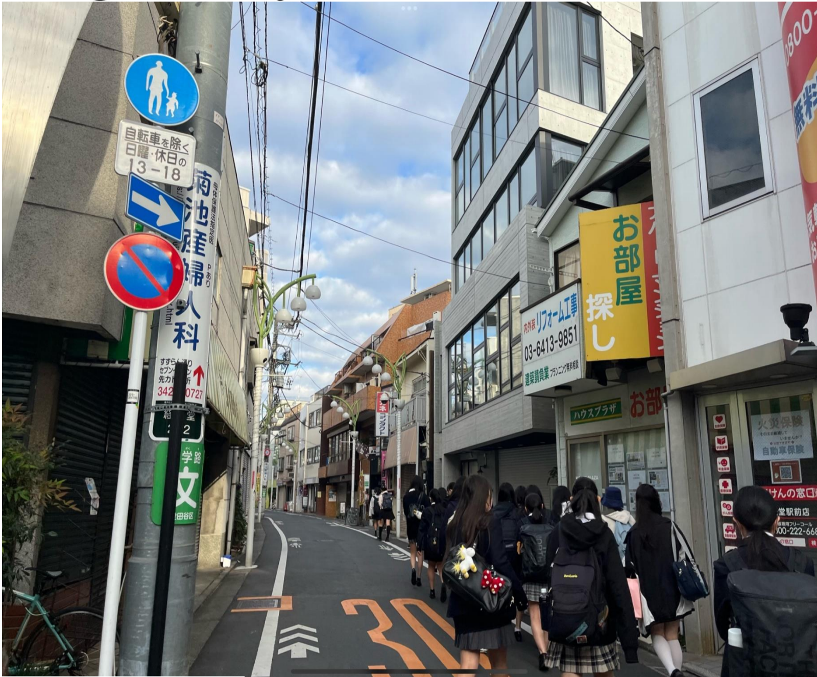
(caption) street of Suzuran