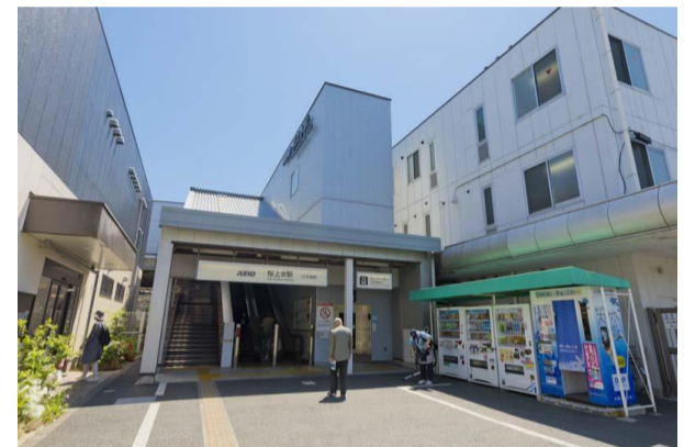
(caption) Sakurajosui station