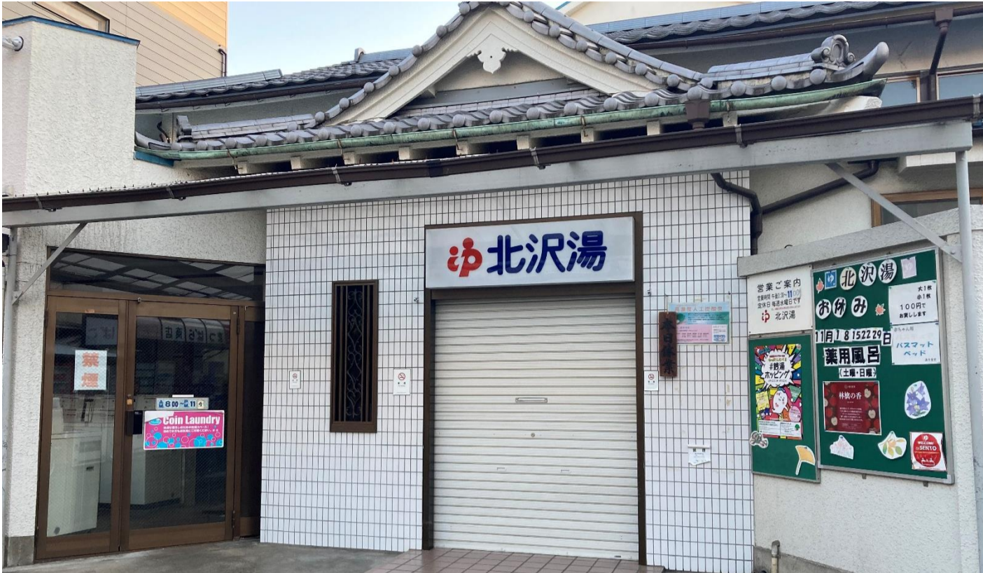
(caption) Kitazawayu

Kitazawa-yu was established at the beginning of the Showa period, and the current proprietress is the third generation. Kitazawa-yu is a miya-zukuri building located at the north exit of Kamikitazawa Station on the Keio Line, following the railroad tracks in the direction of Sakurajosui. While maintaining the same brightness and cleanliness, the bath facilities have been powered up. The number of bathtubs has been reduced, the wash area has been widened, and the jets have been upgraded to high-power jets in addition to the vibrators in the baths.