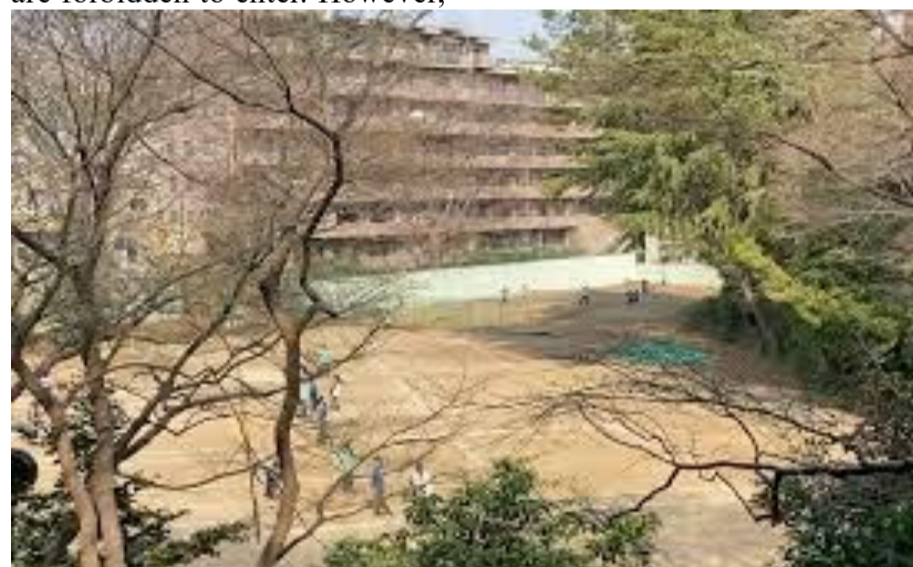
Shoei's forest

When you go a little deeper into Shoei, you are met with a tiny forest. It is full of nature; however the students cannot step one foot into the forest. The fallen leaves and potentially dangerous creatures make it a place which students are forbidden to enter. However,