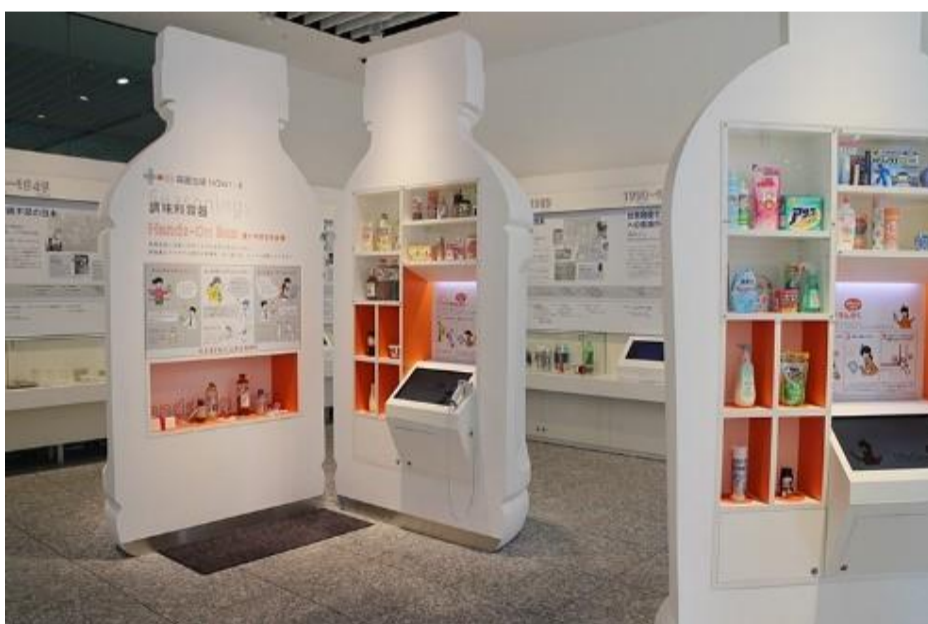
A picture of Museum of Package Culture

Have you ever experienced difficulty deciding where to hang out with friends? Unlike public schools where most students live in close areas, students in private schools like Shoei come from many different areas. Therefore, it is difficult to pick the perfect place