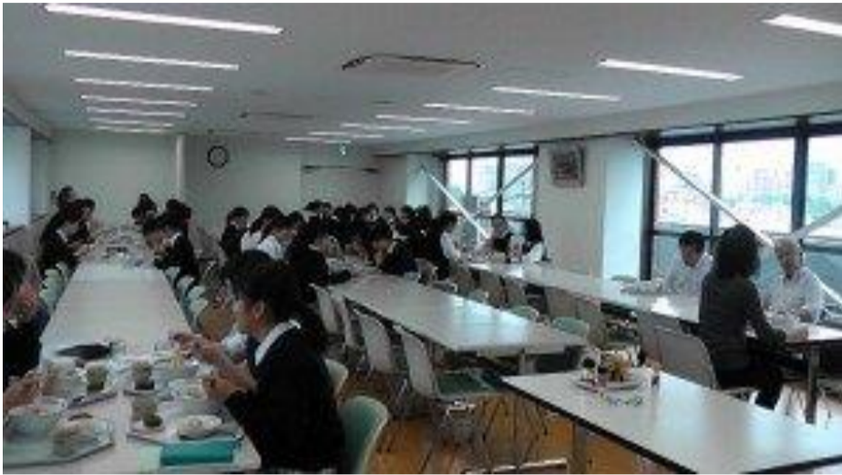
Shoei's cafeteria

Many Shoei students eat lunch from the school's cafeteria, but have you ever wondered how the cafeteria workers manage to make many of those delicious meals every day? We would like to introduce you to the cafeteria workers' busy daily schedule, and