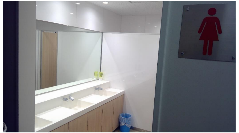
The bathroom on the bottom floor of the white house

On the contrary, the worst bathroom by far is the one on the lowest floor of Greenhill House. It had over half of the votes, which seems reasonable with its yellowish interior and musty atmosphere. To say the least, there