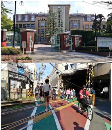
Shopping streets in Shimotakaido Station

The Shimotakaido Station area thrives with five major streets: Ekimae-dori, Nichidai-dori, Ichiba-kitaguchi-dori, Koen-dori, and Cinema-dori.