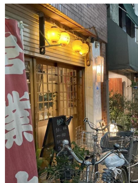
Scene the shopping street

Kamikitazawa is a lot of delicious food in Kamikitazawa. For example, partfait, ramen and yakiniku. So, It is a popular for woman. But, there is only the bare minimum. There are many residential areas. By the way, why are there so many regional areas in Kamikitazawa? Because suburban