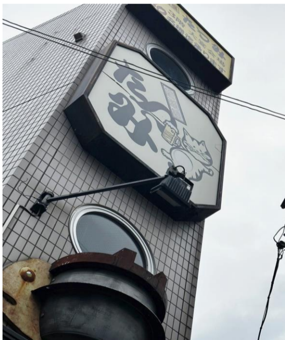
Taiyaki shop Tatsumiya

This article describe about SHIMOTAKAIDO 's history and shopping street.