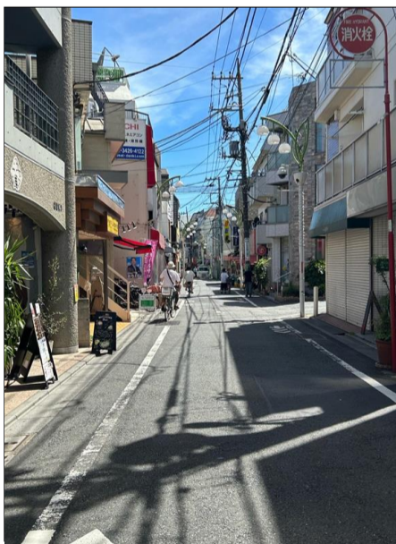
(KYODO DOWNTOWN)

Here we would like to introduce the charm of Kyodo! Many people have the impression that parts of Setagaya Ward in Tokyo, such as Seijo and Kyodo, are high-class residential areas where many wealthy people live. In