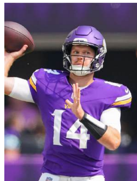
Sam Darnold passes against the Las Vegas Raiders.