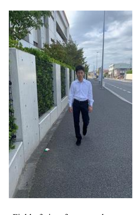
Field of view from people

By Kobayashi Takehiro, Itabashi Michiaki