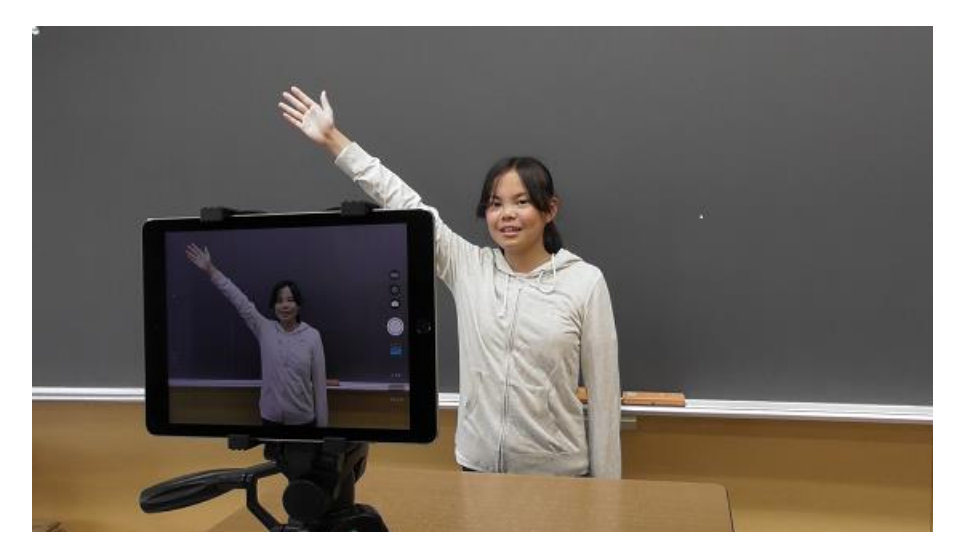
Sunrise exam image