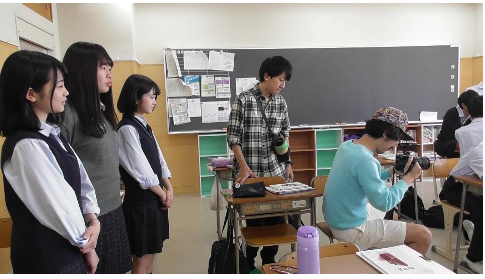
Students help from location hunting to shooting