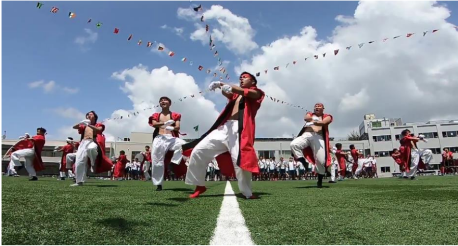
MEDIA COMMITTEE PHOTO

A Pep Squad is performing. All students are grouped into 4 Squads.